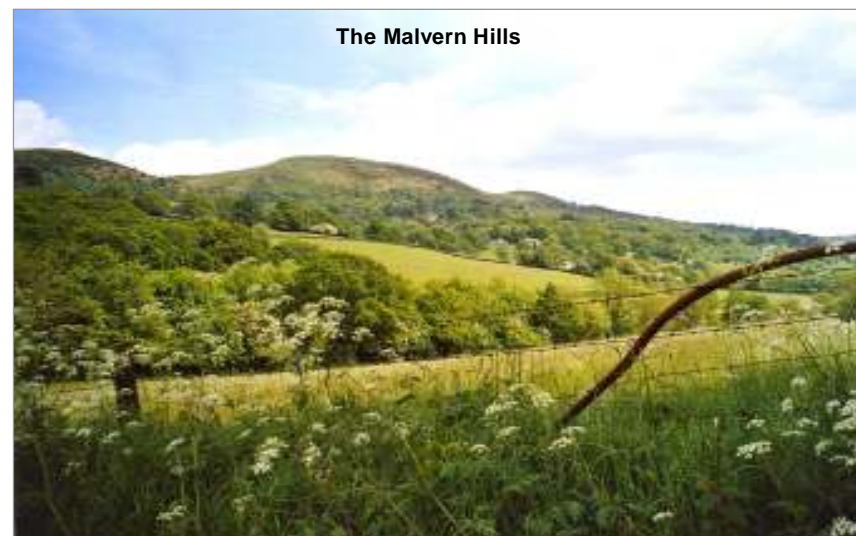
The Malvern Hills