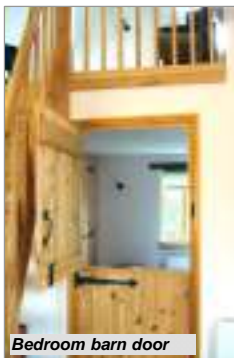
Bedroom barn door