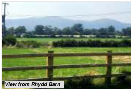
View from Rhydd Barn