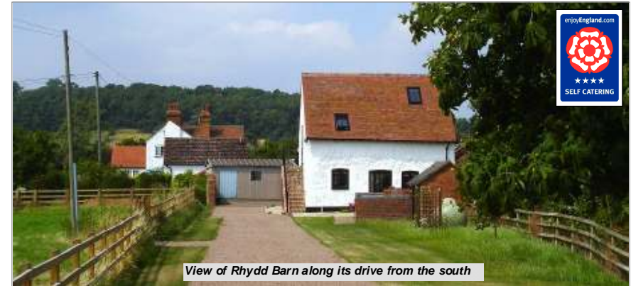
View of Rhydd Barn along its drive from the south

Outstanding 4-star barn conversion with spacious accommodation on three floors and wonderful views of the Malvern Hills.